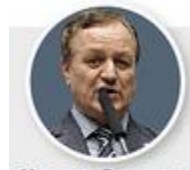
VALDIR COLATTO (MDB-SC)

FIBRIA – Major global producer of cellulose from eucalyptus R$ 50,000